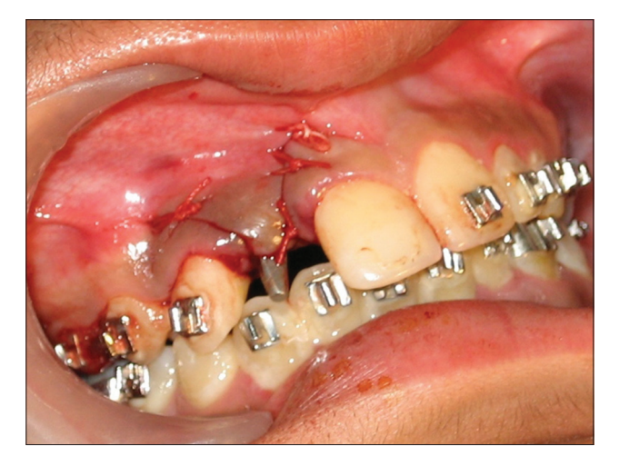
Figure 8: Closure of flap