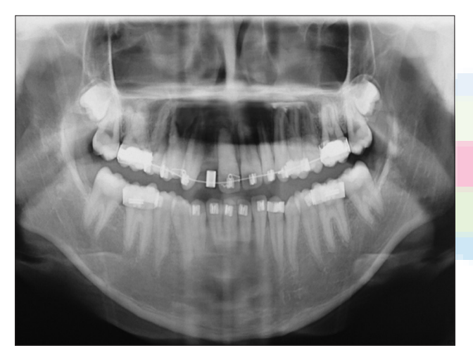
Figure 2: X-ray OPG show congenitally missing maxillary right lateral incisor

3. Dental models and clinical photographs: Dental models were articulated on semi-adjustable articulator to evaluate the centric relationship, inter-arch occlusal clearance, and occlusal discrepancy for esthetic evaluation.