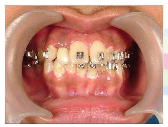
Figure 11: Cement retained prosthesis given over implant after healing of soft tissue around implant