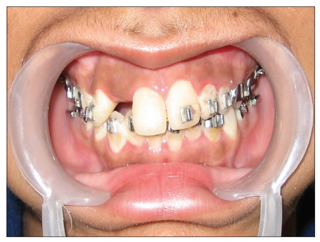
Figure 1: Clinical photograph of patient shows congenitally missing maxillary right lateral incisor

Exclusion criteria were: Uncontrolled systemic disease, radiation therapy in the oro-facial region, smoking,